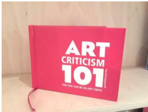
4 - Art Criticism 101