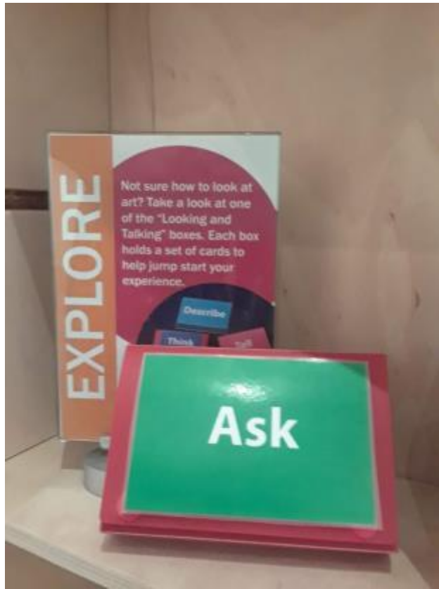
3 - Looking + Talking cards