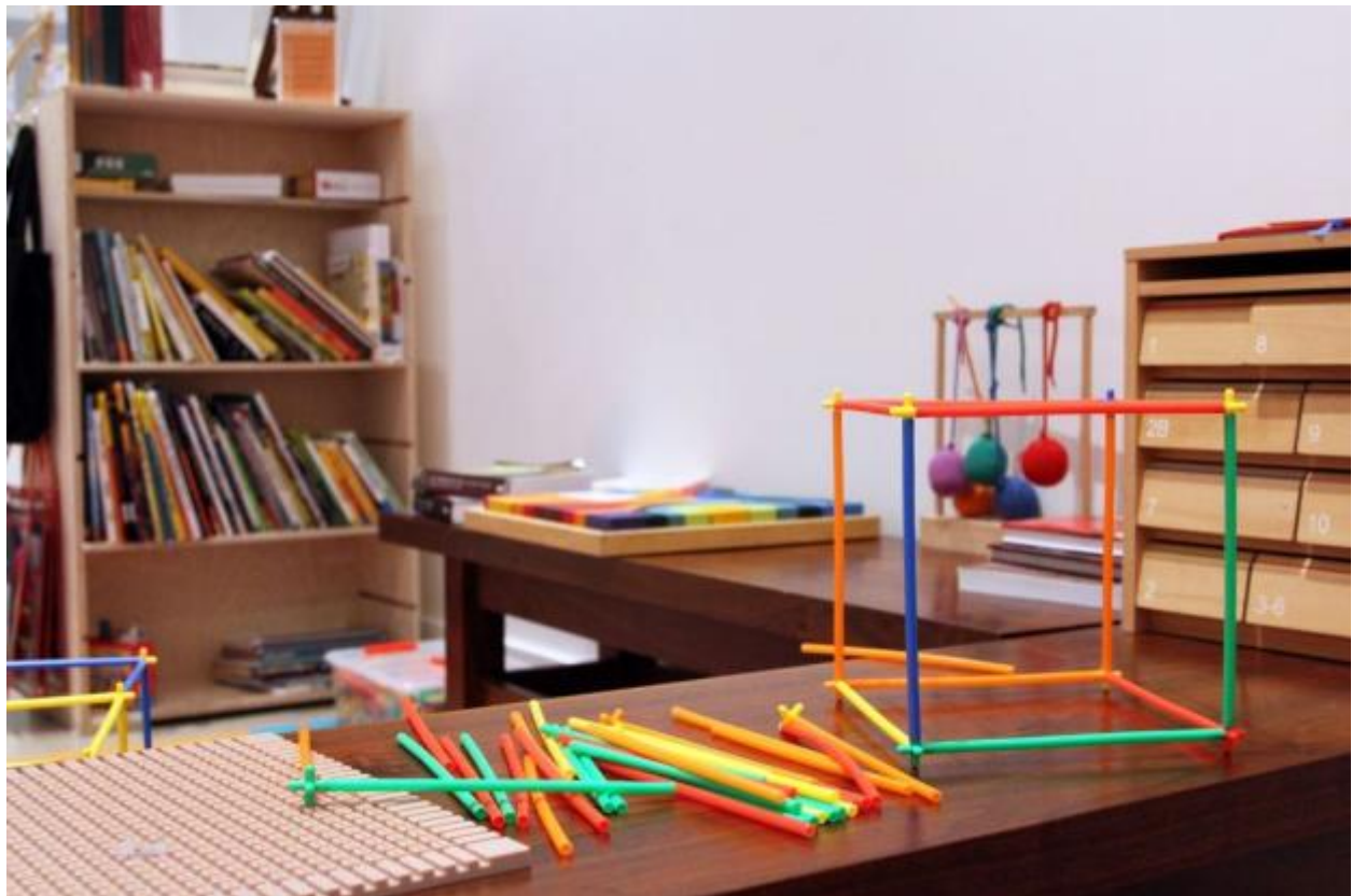
Photo Puzzle: Want to exercise your brain? Use the computers in the artLAB to solve puzzles of the photographs featured in our show.

Framing Focus: Think about what is within and beyond the the frame by creating your own viewfinder and snapping a picture of what interests you.