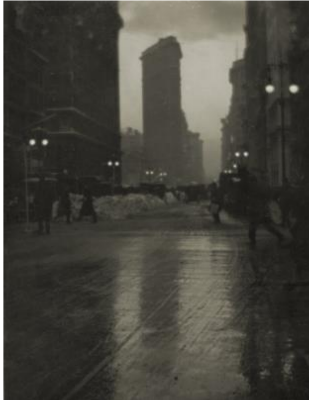
1 - Struss, Karl