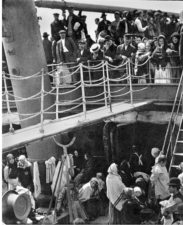
3 - Learn more about Alfred Stieglitz thoughts when taking the famous photography, Steerage . 3